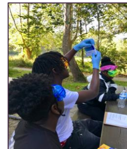
Let's check the level of nitrates in the Maumee River