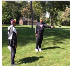
Students collecting Surface Temperature data.