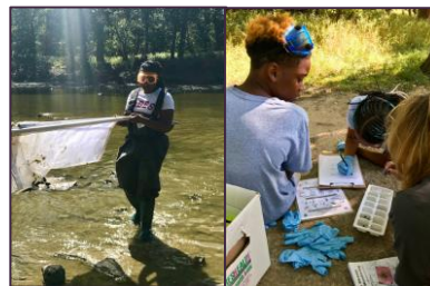
Looking at Macroinvertebrates living in the Maumee River