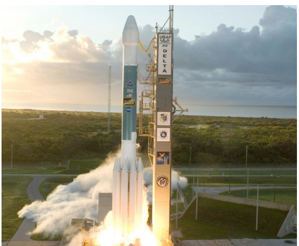
The ELaNa X CubeSats will launch aboard a Delta II rocket as auxillary payloads on the Soil Moisture Active Passive (SMAP) mission.

The CubeSat Launch Initiative (CSLI) enables the launch of CubeSat projects designed, built and operated by students, teachers and faculty to obtain hands-on flight hardware development experience. CSLI also provides access to space for CubeSats developed by the U.S. government and non-profit organizations giving all these CubeSat developers access to a low-cost pathway to conduct research in the areas of science, exploration, technology development, education or operations. Since its inception in 2010. the initiative has selected more than 100 CubeSats from primarily educational and government institutions around the U.S. These miniature satellites were chosen from a prioritized queue established through a shortlisting process from proposers that responded to public announcements on NASA's CubeSat Launch Initiative. NASA will announce another call for proposals in early- to mid-August 2015.