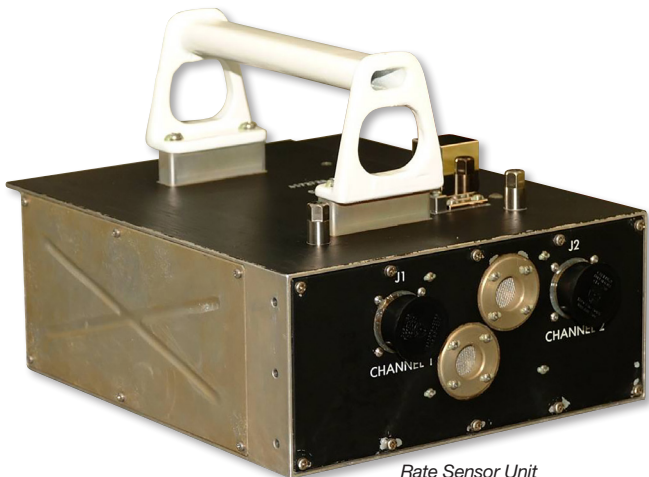
Rate Sensor Unit

Hubble's gyros are extraordinarily stable and can detect extremely small movements of the telescope. Hubble can lock onto a target without deviating more than 7/1000th of an arcsecond. That's about the width of a human hair as seen from a mile away. When used with other fine-pointing devices, the gyros keep the telescope pointing very precisely for long periods of time, enabling Hubble to produce spectacular images of galaxies, planets, and stars and to probe to the farthest reaches of the universe.