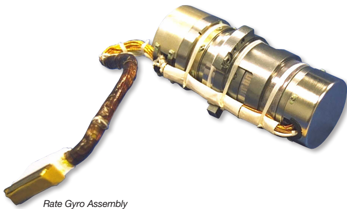
Rate Gyro Assembly