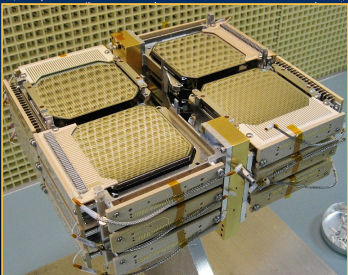
Germanium detectors in a telescope similar to what COSI will use

Exploring the creation and destruction of matter in our Galaxy and beyond