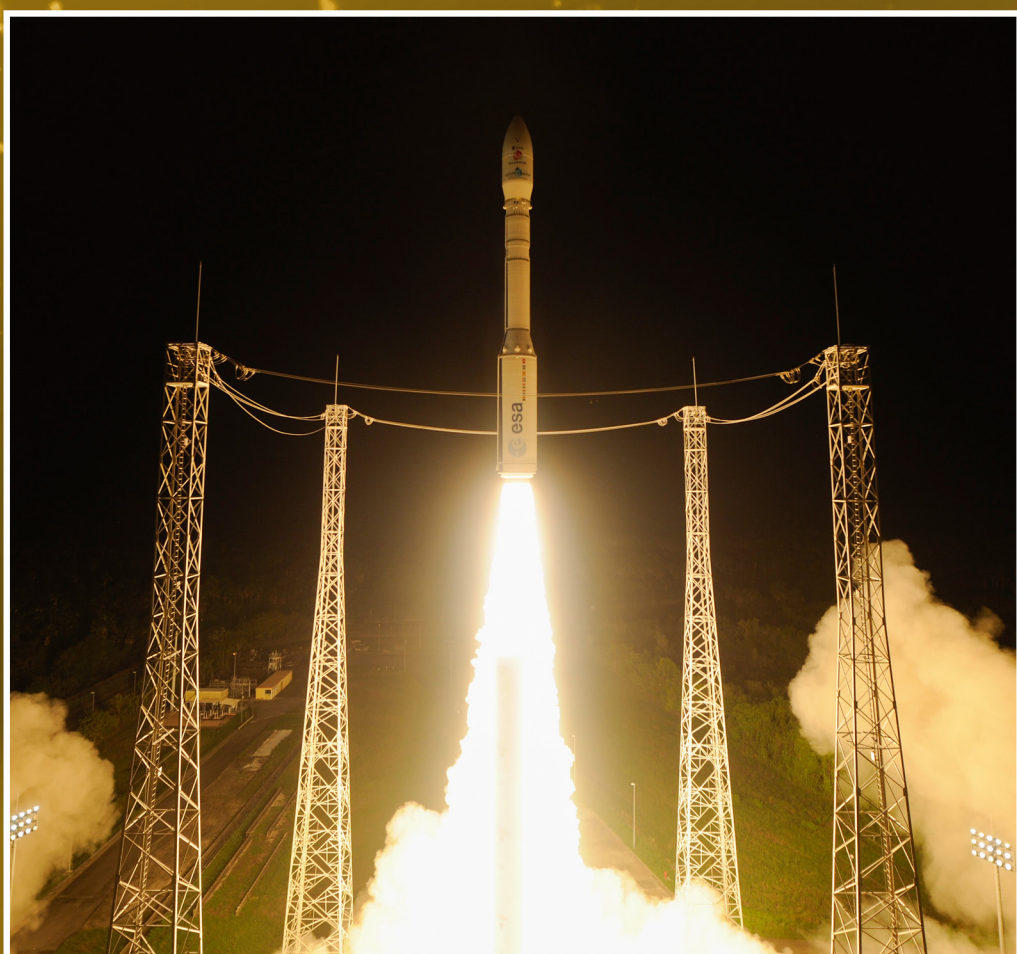
Launch: Vega Rocket – December 3, 2015

PAVING THE WAY TO GRAVITATIONAL WAVE DETECTION IN SPACE