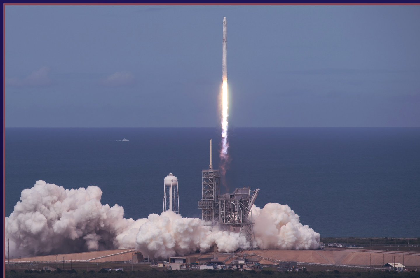
Launch: Falcon 9 Rocket – June 3, 2017

STATION EXPLORER FOR X-RAY TIMING AND NAVIGATION TECHNOLOGY