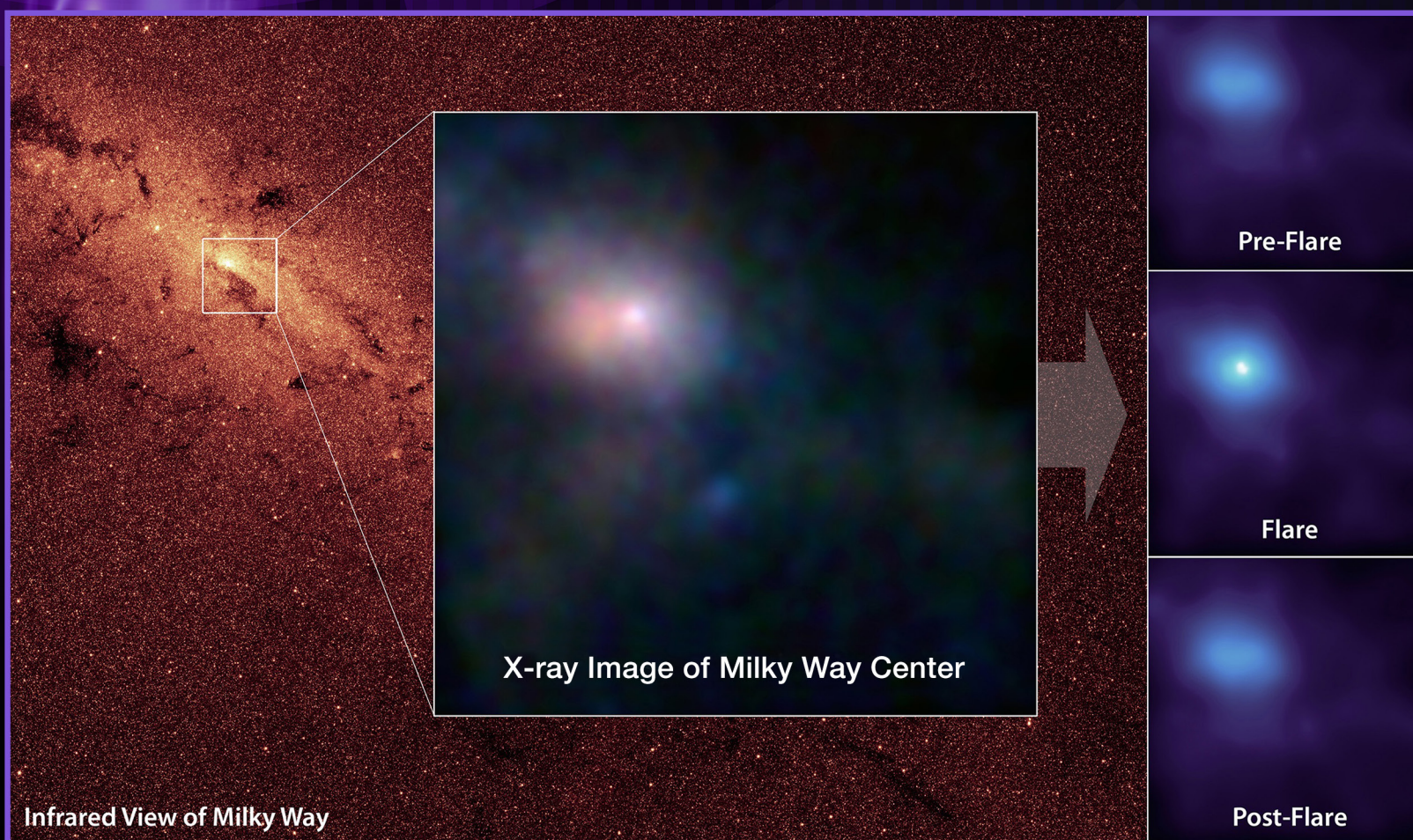
Infrared View of Milky Way