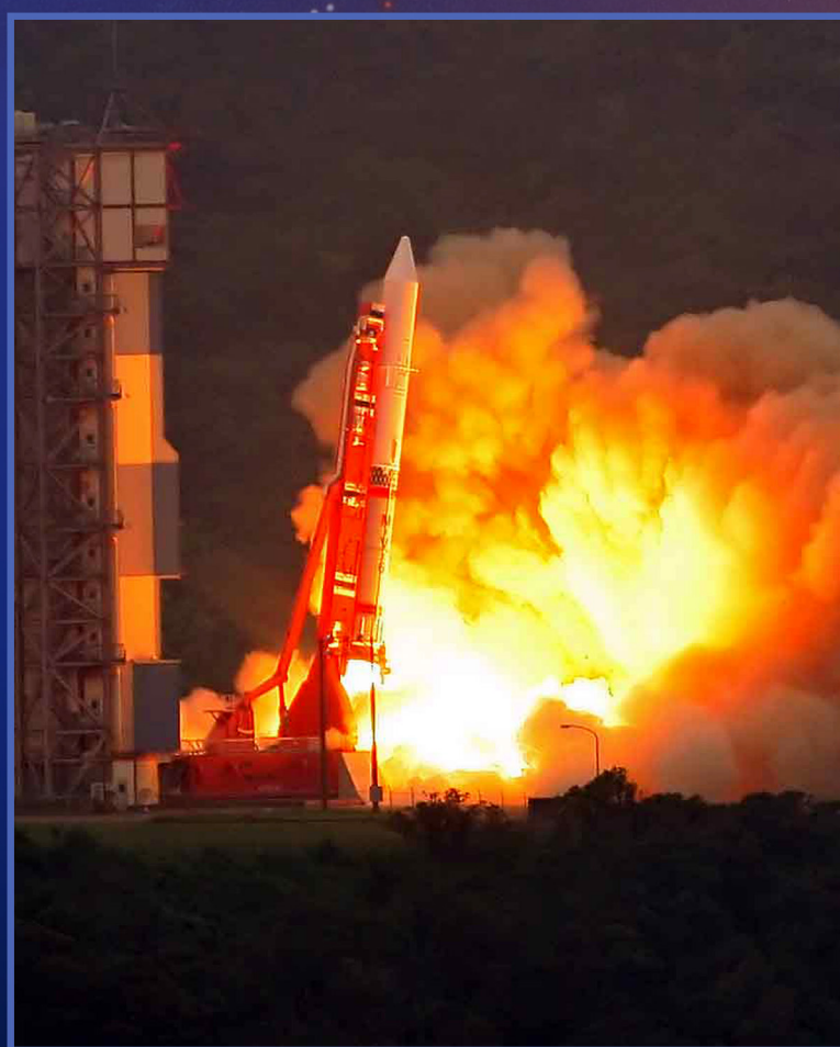
Launch: M-V-6 Rocket – July 10, 2005