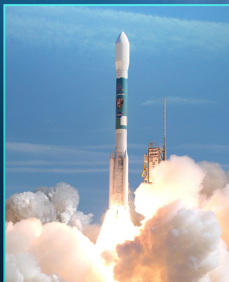
Launch: Delta 7320 – November 20, 2004