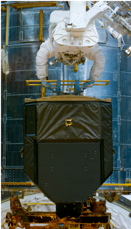
Astronaut Joseph Tanner stows one of Hubble's original Fine Guidance Sensors for return to Earth during Servicing Mission 2.

Launched into Earth orbit in 1990, the Hubble Space Telescope has three Fine Guidance Sensors (FGSs). Subsequently, two of the FGSs were replaced by refurbished sensors during servicing missions. The third FGS is the original sensor.