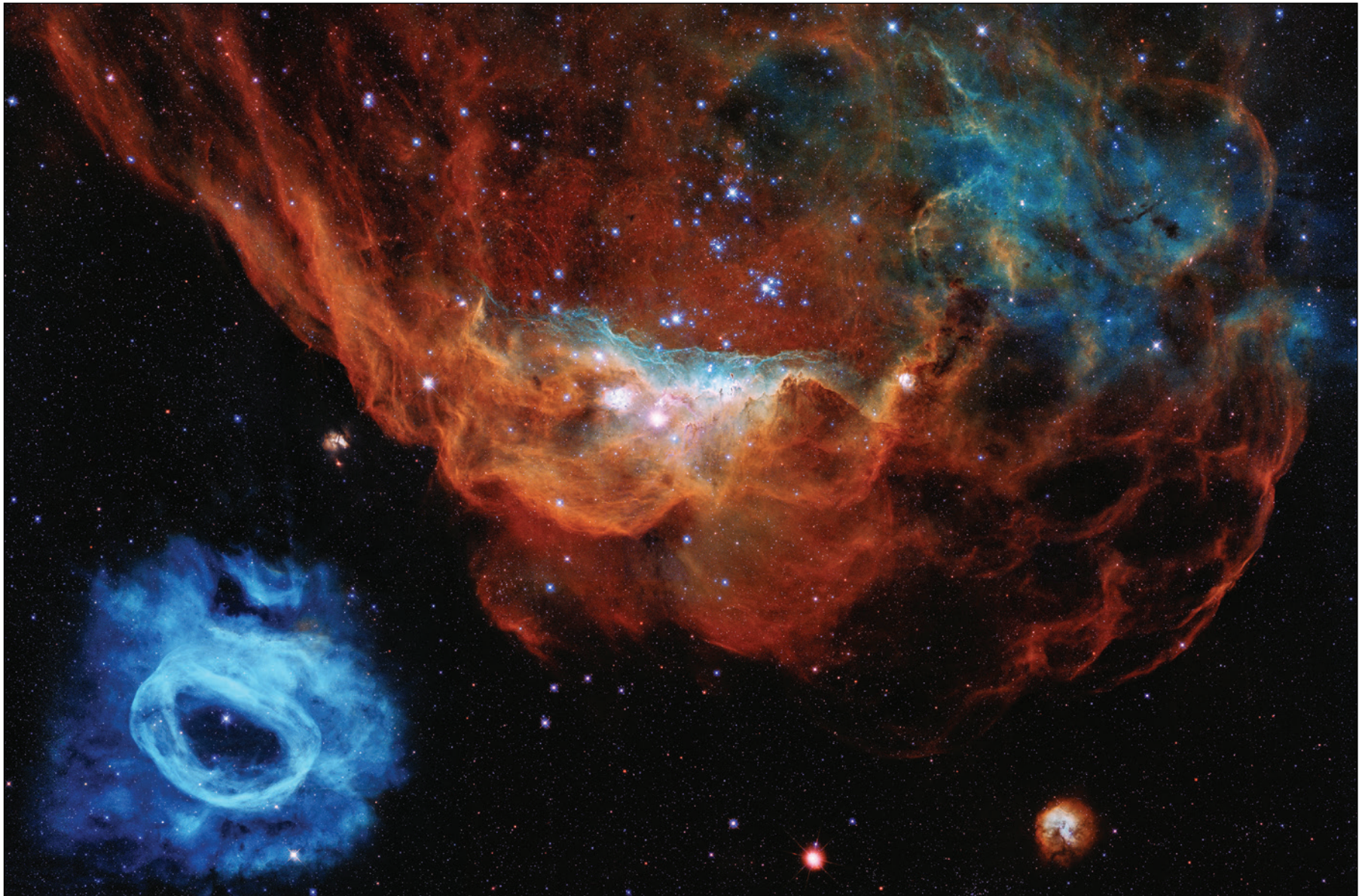
NGC 2014 and NGC 2020