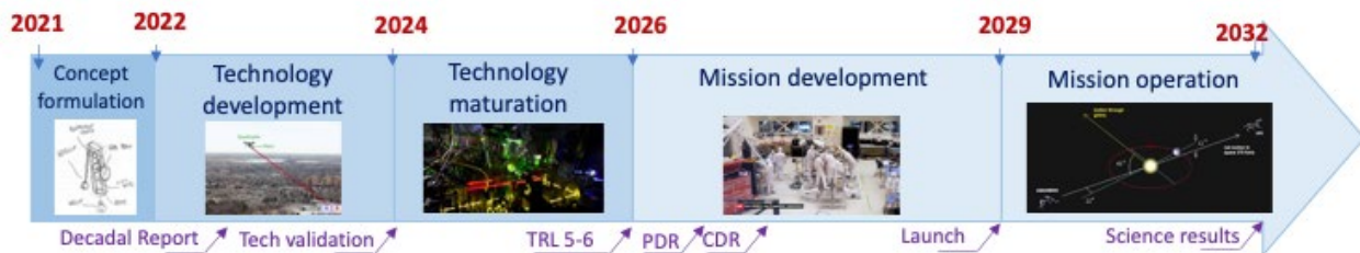
Figure 2. Proposed timeline for the FOCOS mission, including a ground-based technology program in the early years.

The FOCOS orbit has been chosen to offer a large modulation of the gravitational potential while offering good satellite visibility to the ground stations. We note that while this eccentric orbit, and its resulting modulation of the gravitational potential, is required to meet the primary scientific objectives (tests of the gravitational redshift and Lorentz invariance), a circular orbit in medium-earth-orbit might be more natural for other scientific objectives (e.g., an international space-time reference). For the FOCOS mission, to avoid drifts of systematic errors in the clock that would degrade the measurement of the redshift, we favor observing the satellite clock from the same ground location both at apogee and then at perigee with minimal time gap between the two observations, as set by the orbit. We have found that a baseline orbit with a period of about 8 hours, and a perigee altitude of approximately 5,000 km and an apogee of 23,000 km satisfies these requirements and would offer 30 minutes of visibility at perigee and 2-3 hours at apogee. Averaging over ~100 orbits would then yield the desired sensitivity for the redshift measurement.