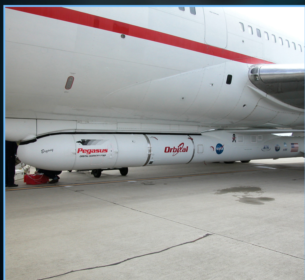
Launch: Pegasus XL – April, 25 2007