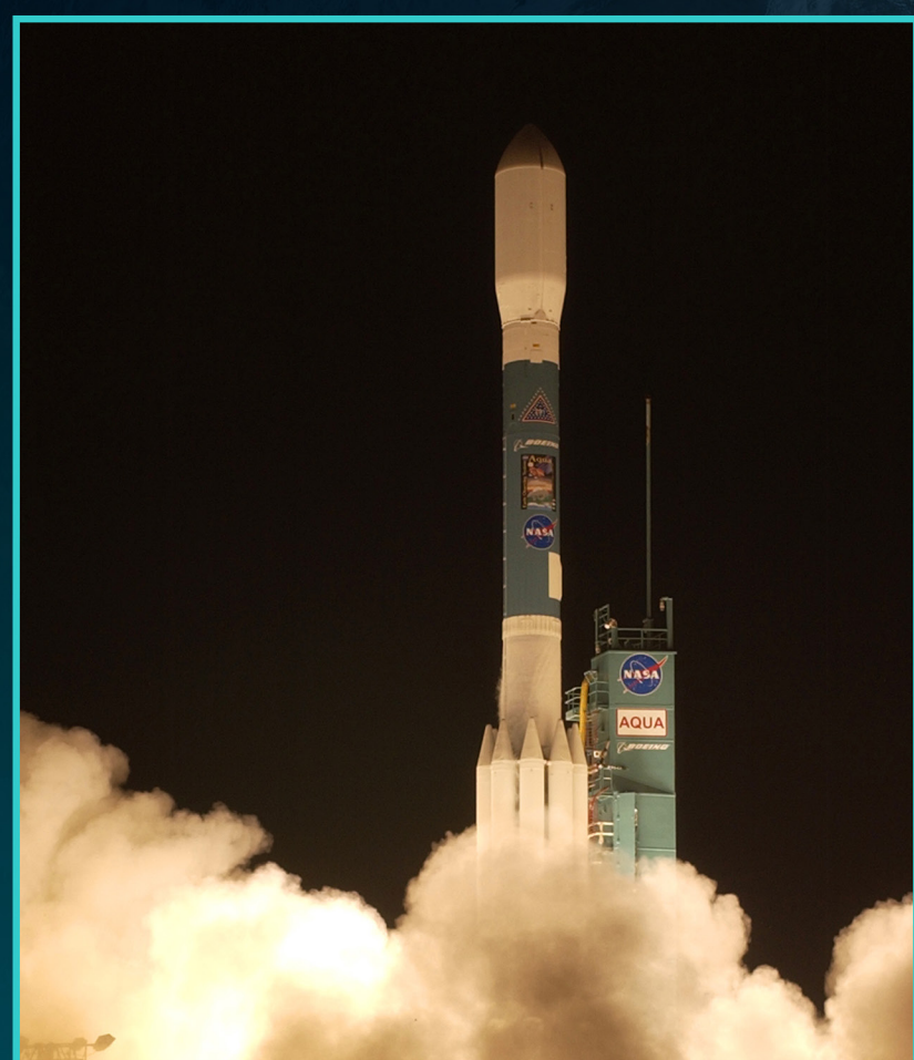
Launch: Delta II Rocket – May 4, 2002