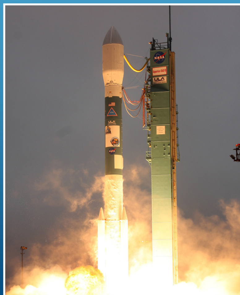
Launched: Delta II – June 10, 2011