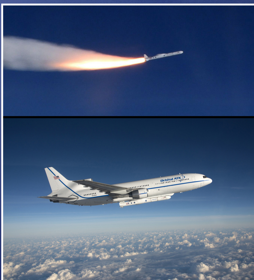
Launch: Pegasus XL – December 15, 2016