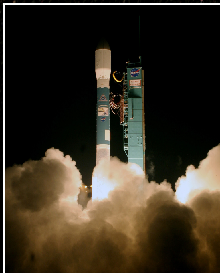
Launch: Delta II – April 28, 2006

Observing the vertical structure of clouds and aerosol layers