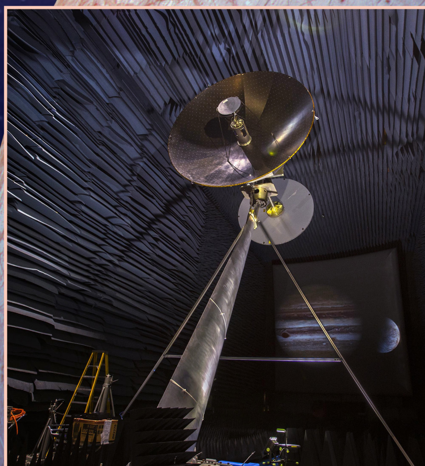
Antenna prototype in testing – April 1, 2019

Exploring the habitability of ocean worlds