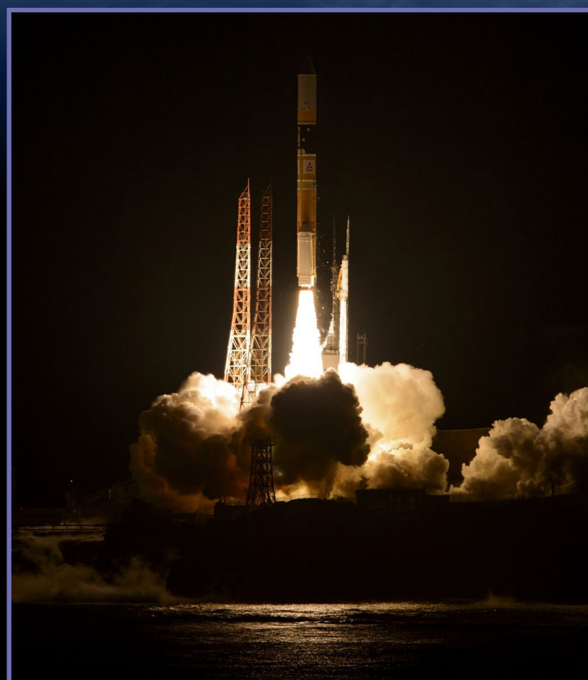
Launch: HII-A Rocket – February 27, 2014