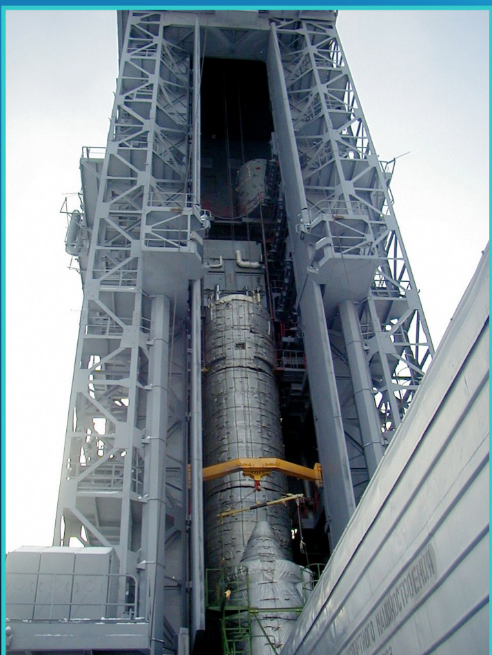
Launch: Three-stage Rocket – March 17, 2002