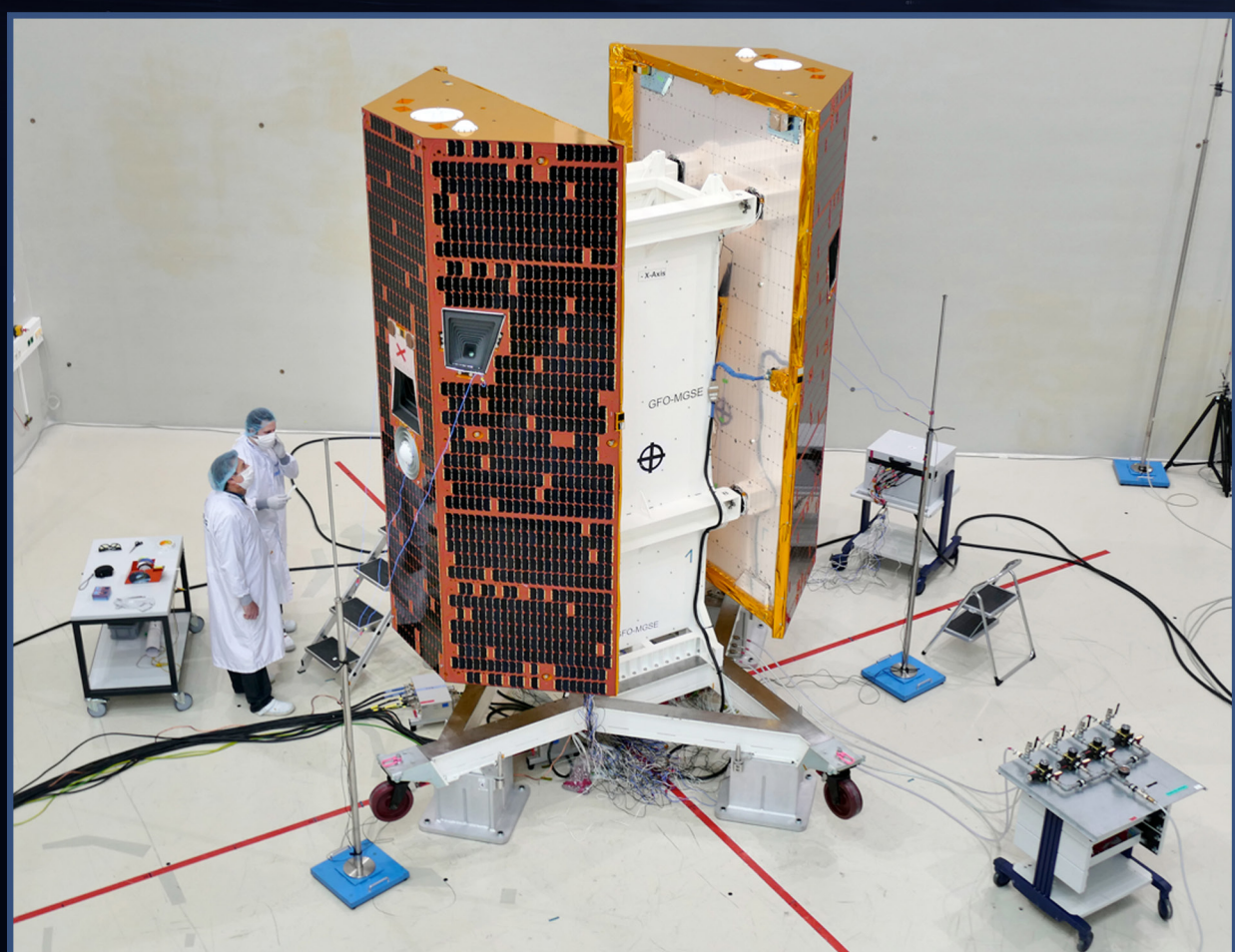
Preparations for acoustic testing – May 2017

Gravity Recovery and Climate Experiment Follow-On Measuring Earth's Mass in Motion