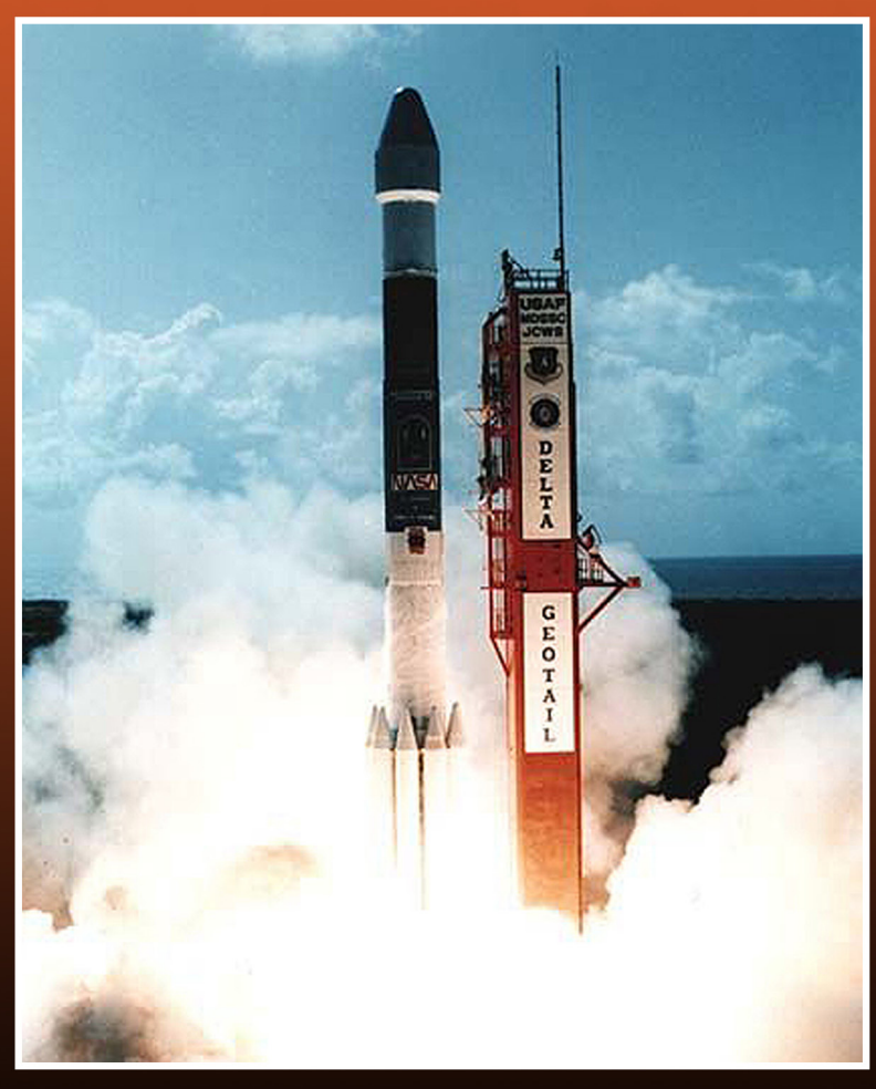
Launch: Delta II – July 24, 1992 www.nasa.gov