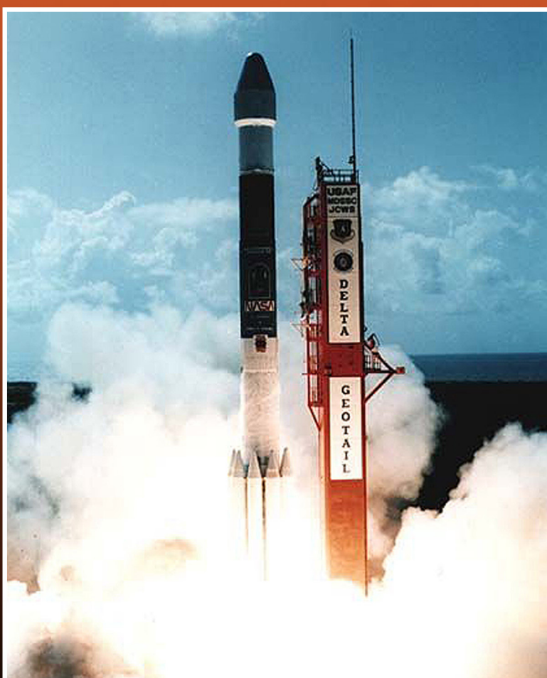
Launch: Delta II – July 24, 1992

Measuring global energy flow and transformation in the magnetotail