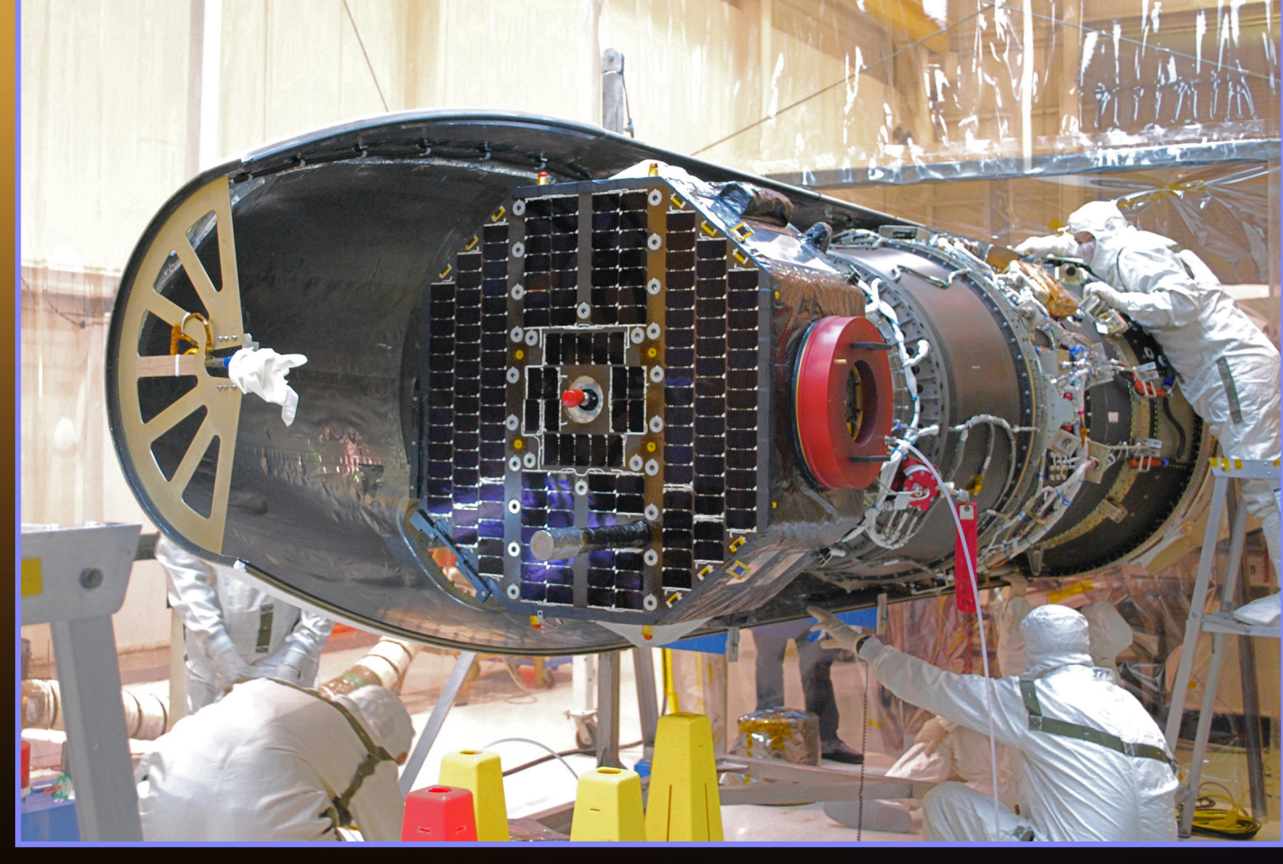
Launch: Pegasus Rocket – October 19, 2008