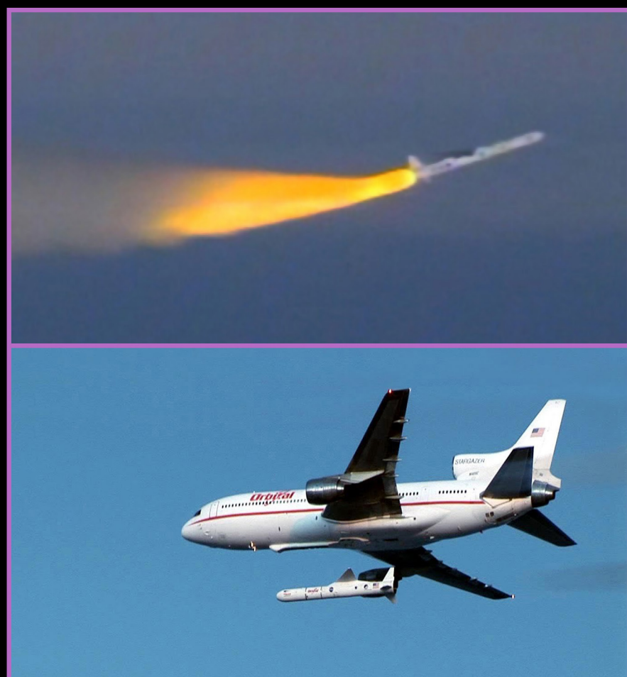
Launch: Pegasus Rocket – June 27, 2013