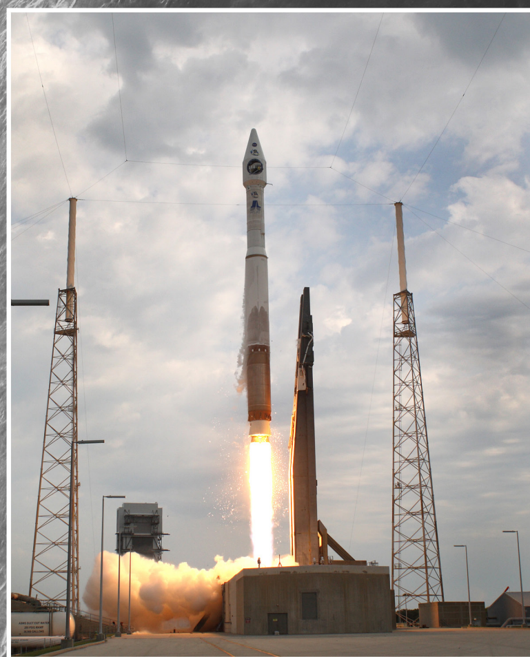
Launch: Atlas V – June 18, 2009