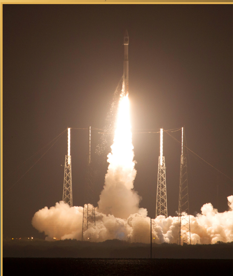
Launch: Atlas V Rocket – March 13, 2015

Studying Magnetic Reconnection Around the Earth