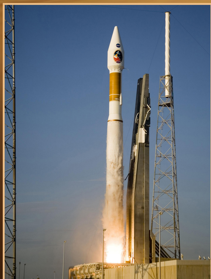
Launch: Atlas V Rocket – August 12, 2005