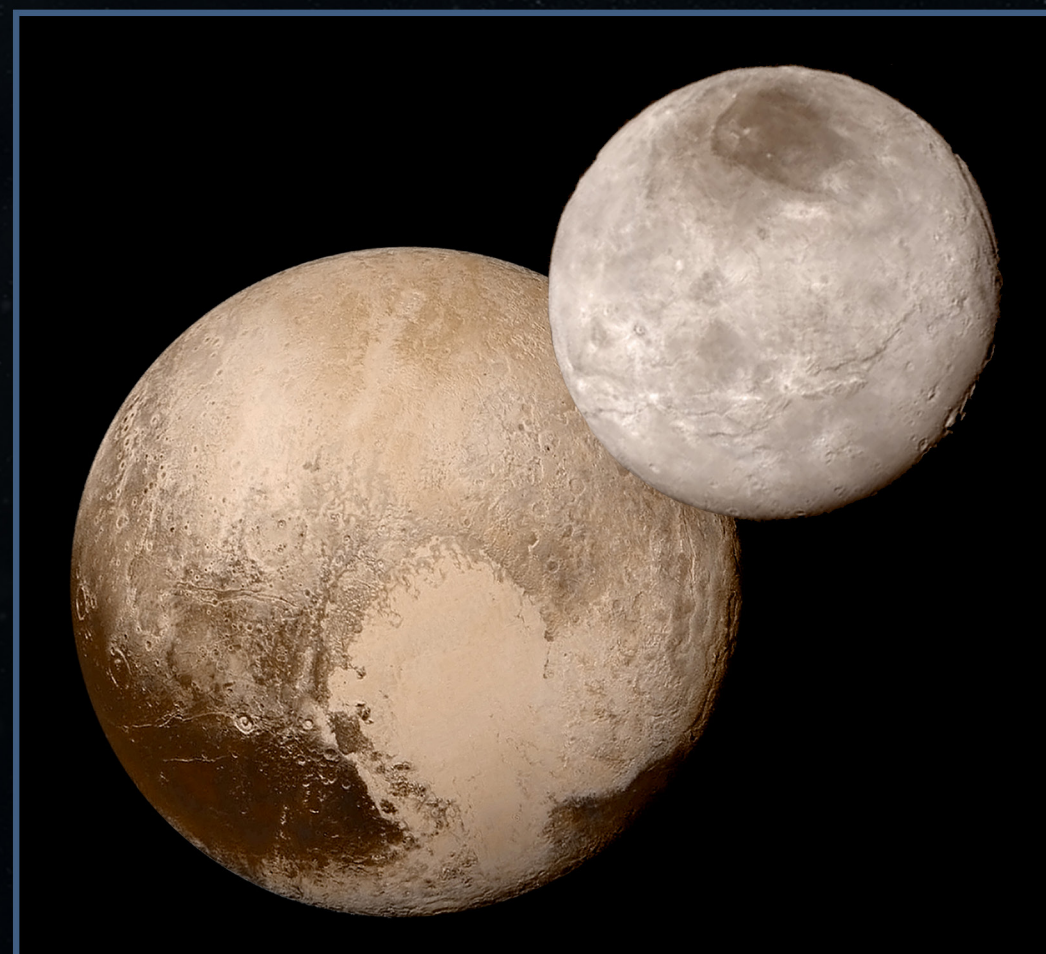
Pluto and its largest Moon Charon – July 13, 2015