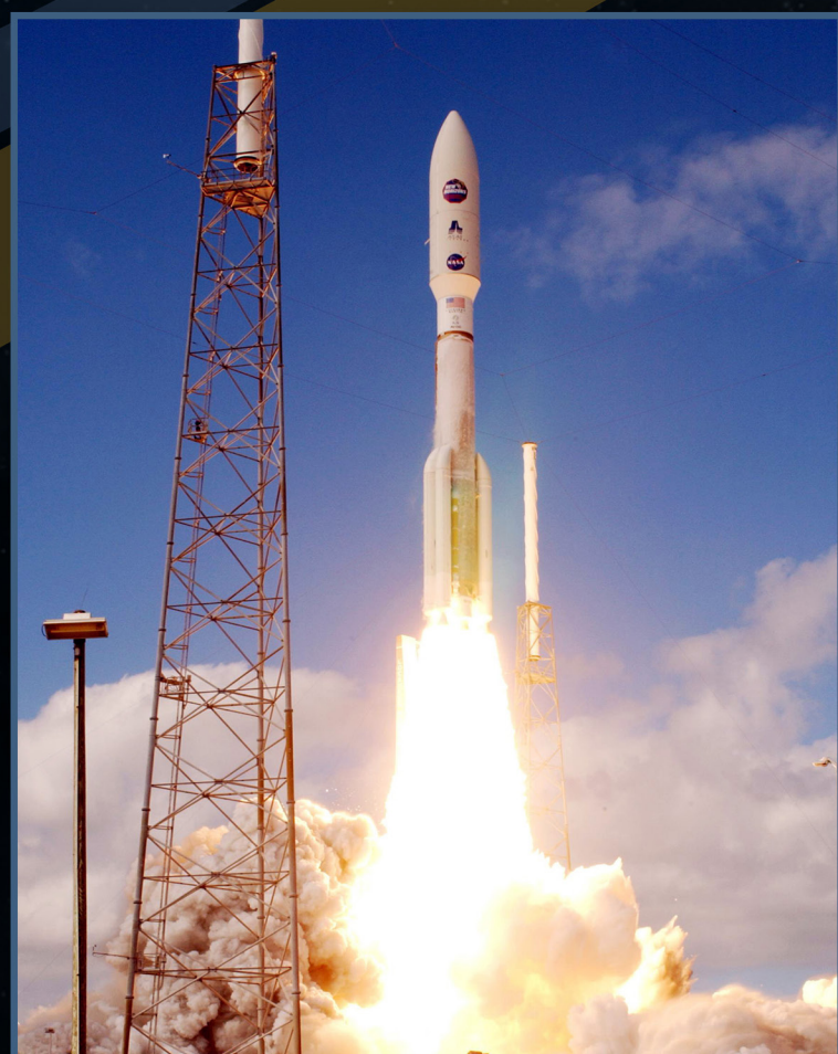
Launch Atlas V 551 Rocket – January 19, 2006

First Mission to the Pluto System and the Kuiper Belt