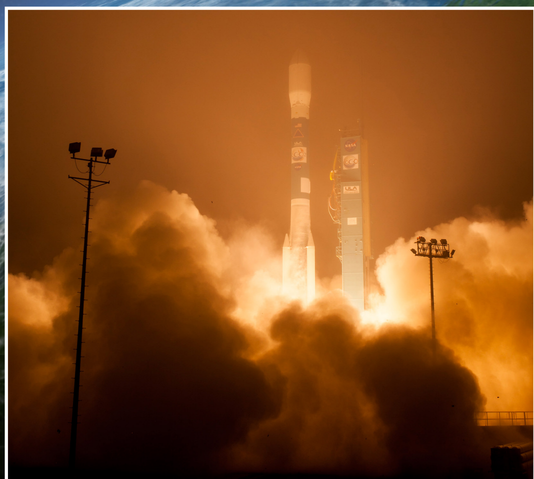
Launch: Delta II – July 2, 2014