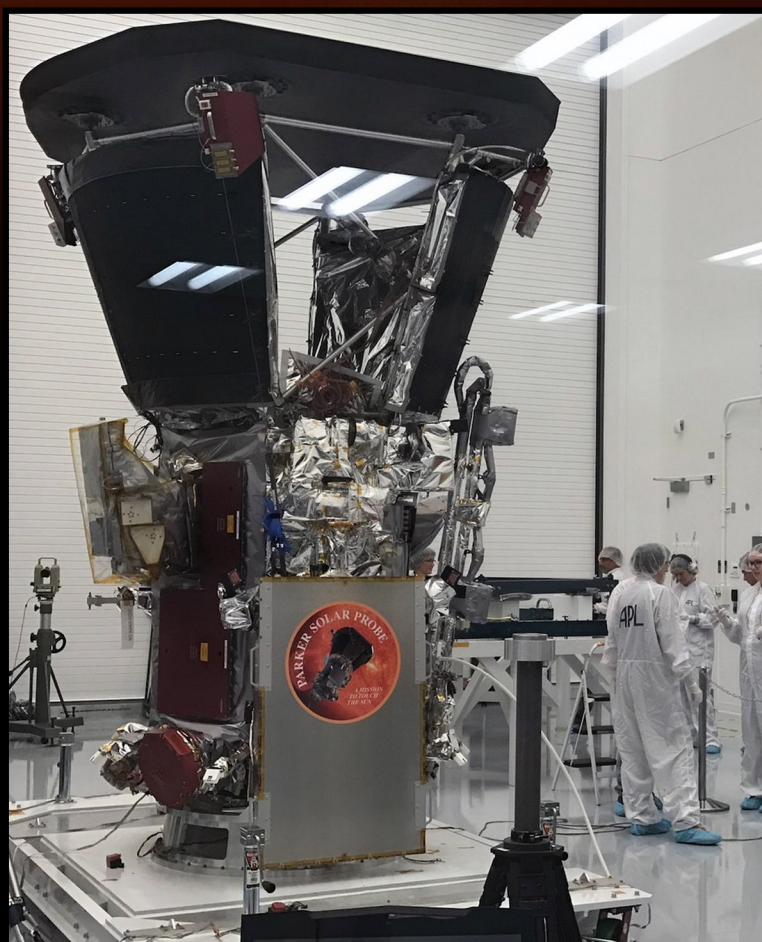
Parker in the APL clean room – September 2017