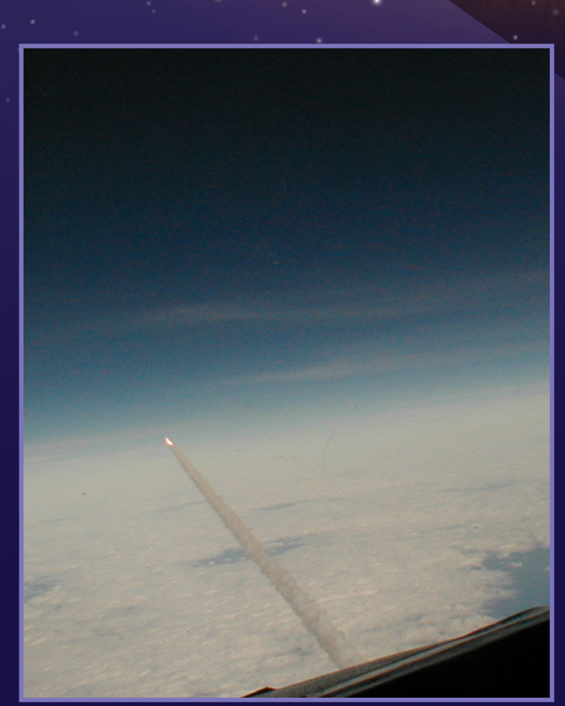
Launch: Pegasus Rocket – February 5, 2002 www.nasa.gov

Exploring the basic physics of particle acceleration and explosive energy release in solar flares