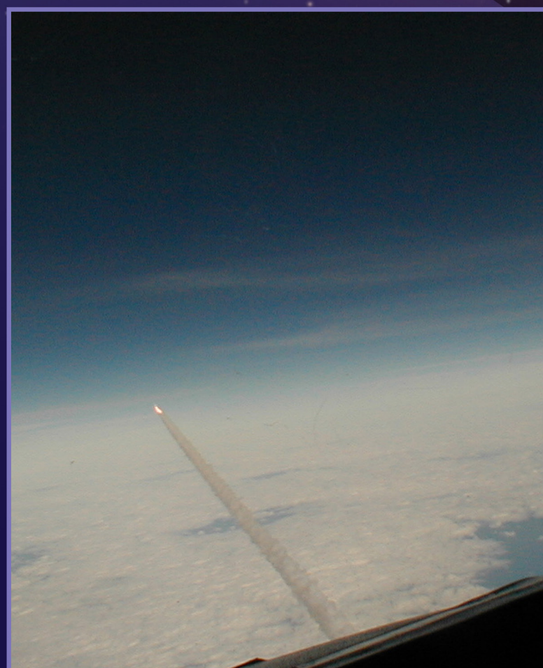
Launch: Pegasus Rocket – February 5, 2002