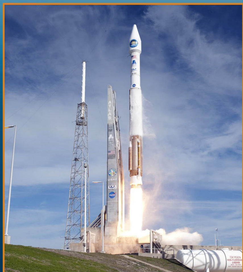
Launch: Atlas V-401 Rocket – February 11, 2010