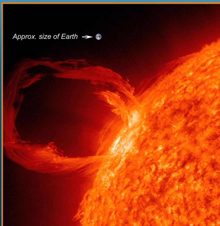
Solar eruptive prominence – March 30, 2010