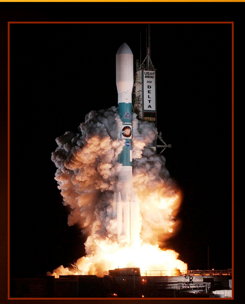
Launch: Delta II – October 25, 2006 www.nasa.gov