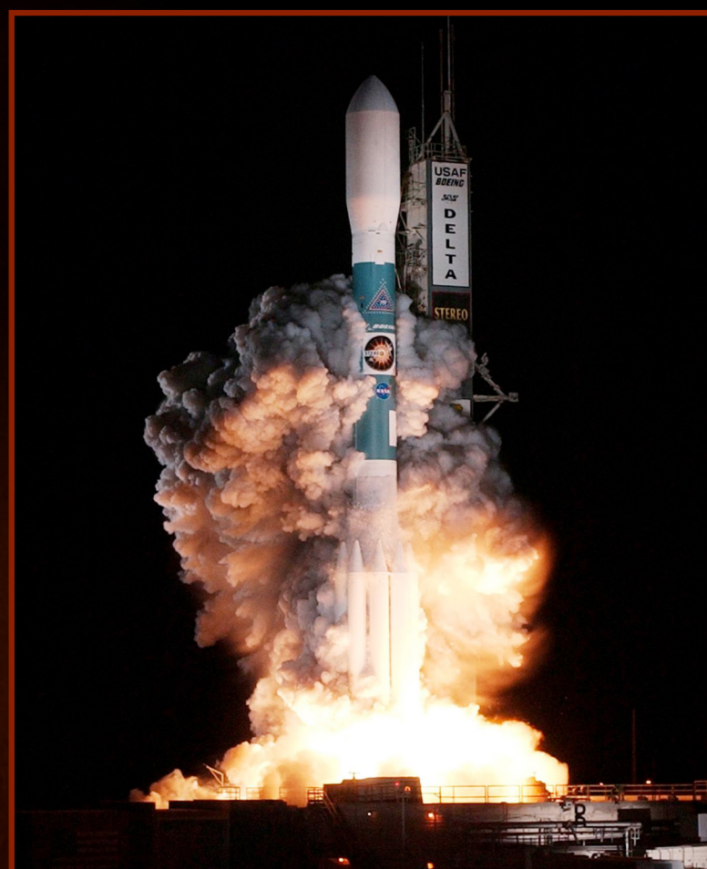
Launch: Delta II – October 25, 2006