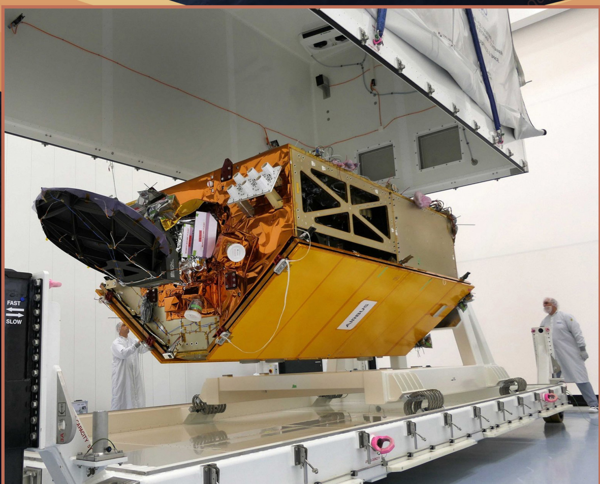
Sentinel-6A in the Clean Room – September 3, 2019