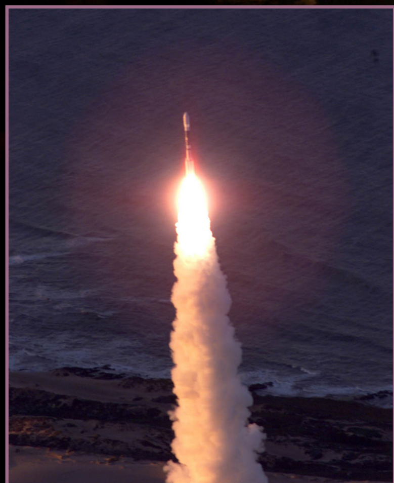
Launch: Delta II – December 7, 2001