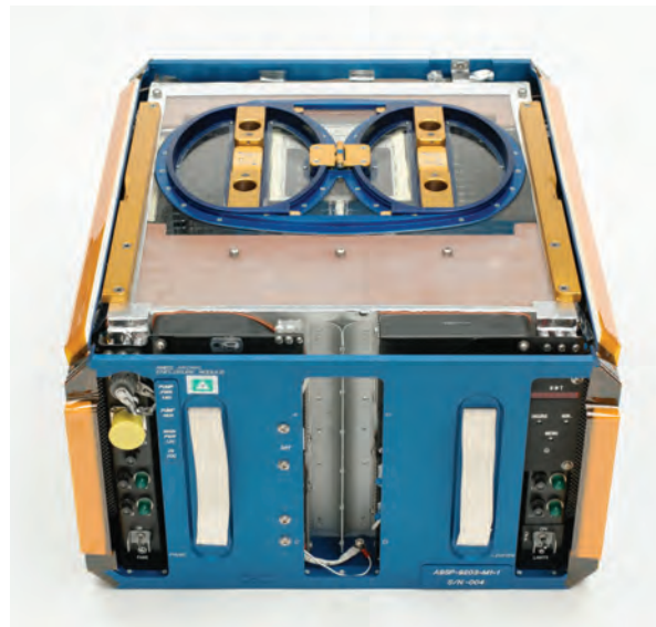
Rodent Transporter - for transportation to the International Space Station.

hardware development project leverages the experience gained from 27 prior flight experiments with rodents using a space shuttle-based system. Advanced capabilities of the new system include housing for longer duration studies than the previous system permitted. In the post-shuttle era, the hardware also must support safe transport of rodents on the commercial resupply service vehicle SpaceX Dragon.