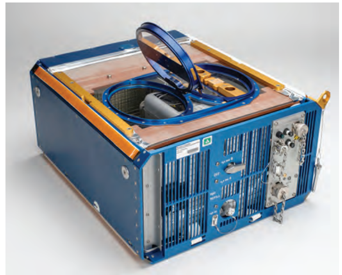
Rodent Habitat – for long term housing aboard the space station, shown here with one of the access doors open.

This project is supported by the International Space Station Program at NASA's Johnson Space Center, Houston and the Space Biology Project at Ames. Funding for Space Biology comes from the Space Life and Physical Sciences Research and Applications Division within the Human Exploration and Operations Mission Directorate at NASA Headquarters.