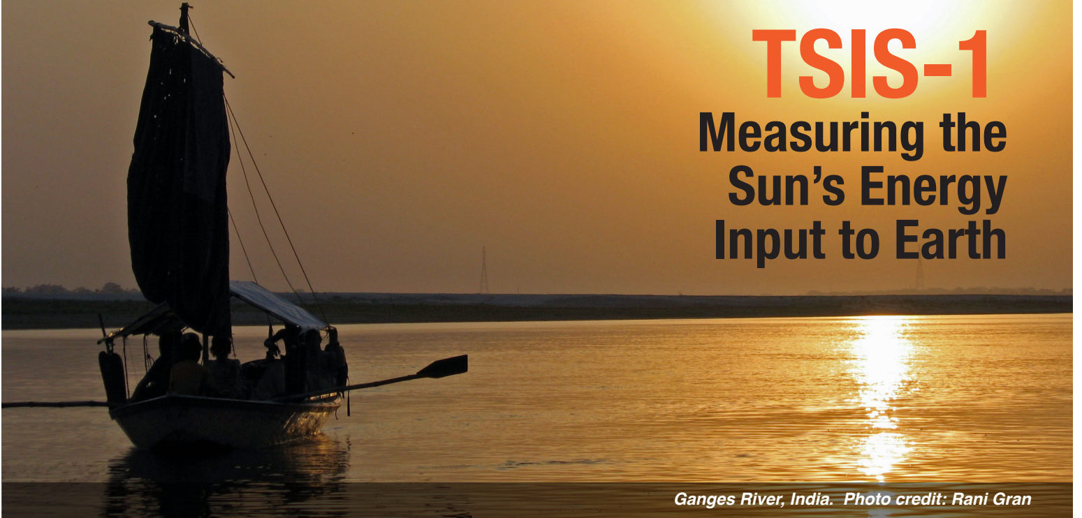
Ganges River, India.