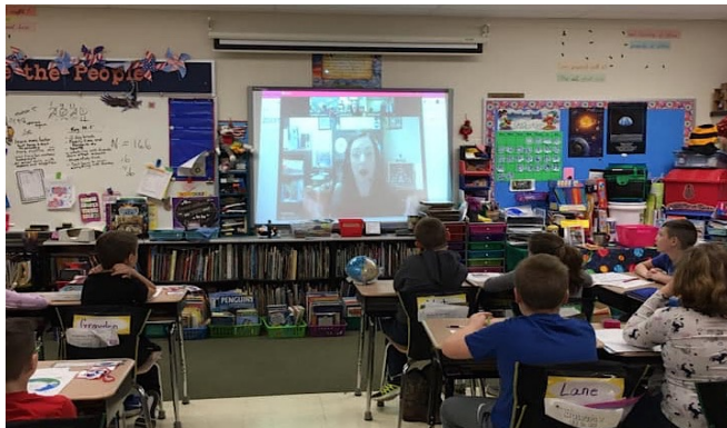
Classroom View of Zoom Conferencing