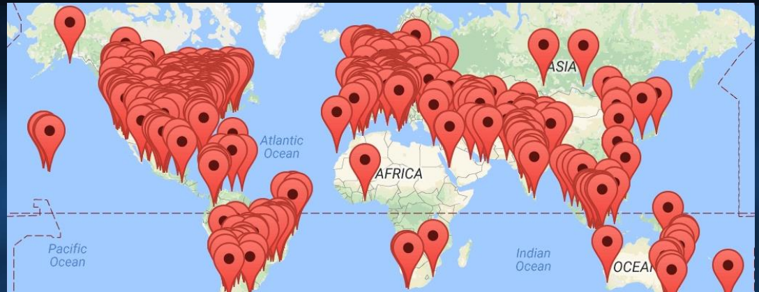
Map of InOMN events registered in 2017. Photos on left from hosts.