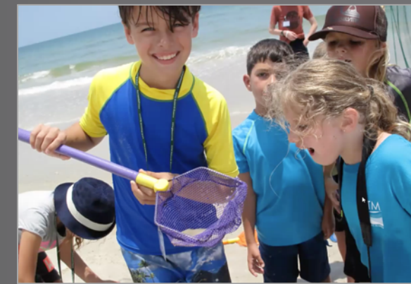
Examples of Informal Education from GTM