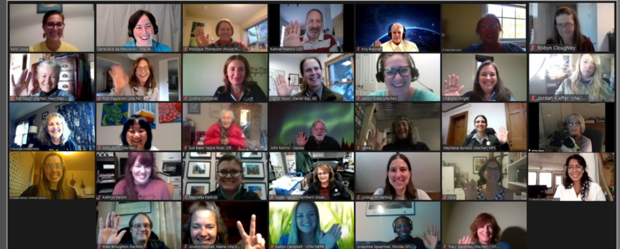
Participants, Coaches, Facilitators, and Presenters enthusiastically engaged in the online workshop