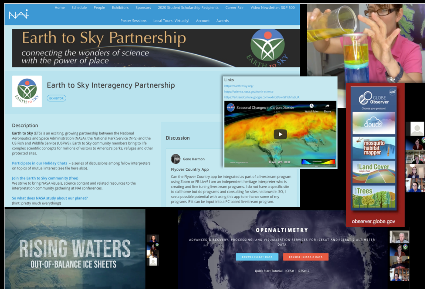
Earth to Sky Booth: Live presentations, Demos, and NASA Resources for Interpreters