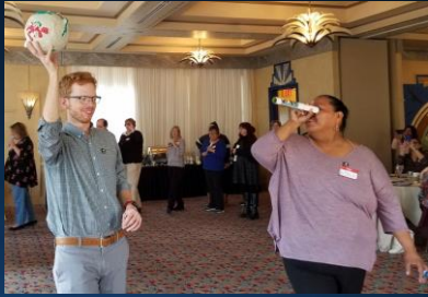
Participants trying the NASA activity, Strange New Planet .