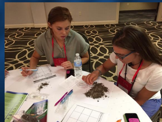
ACA participants make Observations about Ask Questions about a soil sample. Participants completed the phrases: I notice... and I wonder...