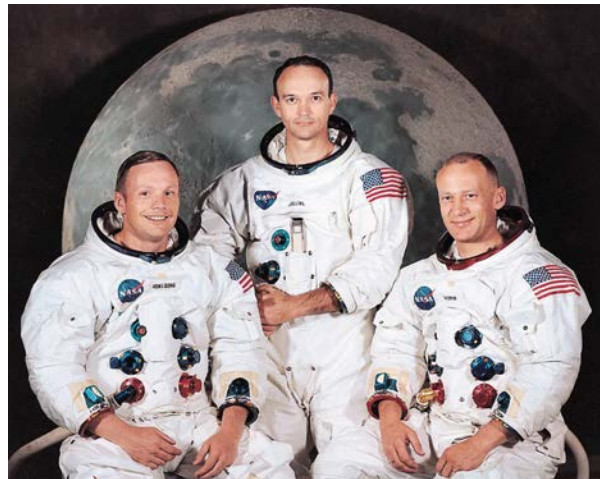
Apollo 11 crew: Commander Neil Armstrong, Command Module Pilot Michael Collins, and Lunar Module Pilot Buzz Aldrin.

about 4.5 billion years ago, so these samples have taught us about the Moon's early history.