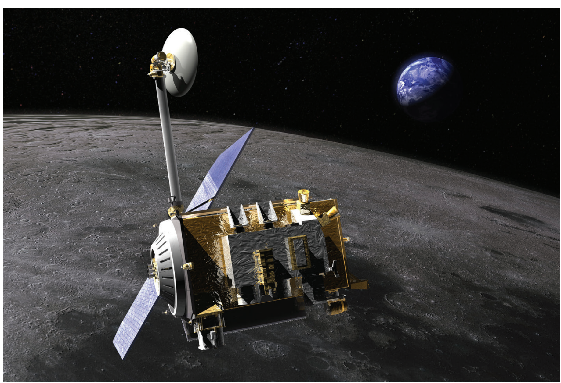
LUNAR RECONNAISSANCE ORBITER: Mapping the Moon for future generations