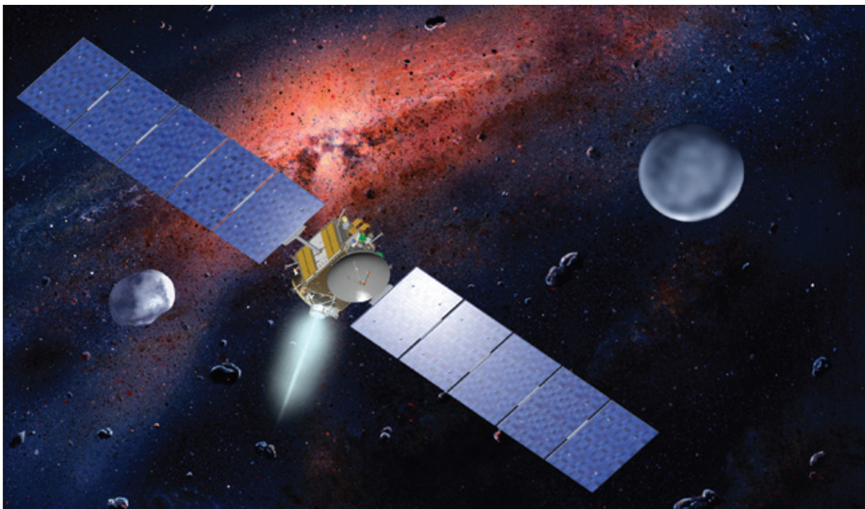
The Dawn spacecraft will provide exciting and valuable data from its ambitious journey to Vesta (left) and Ceres (right).

Caught up in a cosmic tug of war between the Sun and Jupiter, two of the largest inhabitants of the main asteroid belt, Vesta and Ceres, survived the collisional environment of the region and have remained intact since their formations. Furthermore, evidence shows that each has distinct characteristics; therefore, each must have followed a different evolutionary path. Vesta appears to be dry, evolved, and differentiated with surface features ranging from basaltic lava flows to a deep crater near its southern pole. Ceres, in contrast, has a dusty, clay-like surface and evidence of water, which has led scientists to suspect the presence of a thick water-ice mantle. Vesta’s physical characteristics reflect those of the inner planets, whereas Ceres’ are more like the icy moons of the outer planets. By studying these contrasts and comparing these two minor planets, scientists will develop an understanding of the transition from the rocky inner regions to the icy outer regions of the Solar System.