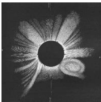
Left: Sketch of 1860 total solar eclipse showing a coronal mass ejection. Image: G. Temple/NASA.